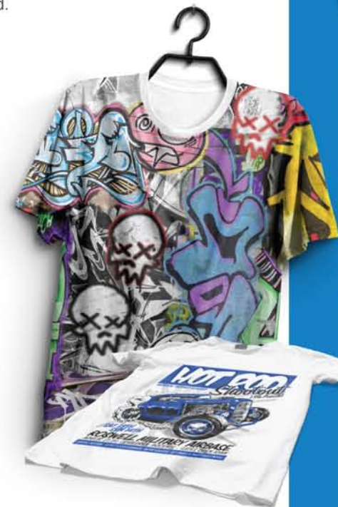
Platen options available for single or all over prints