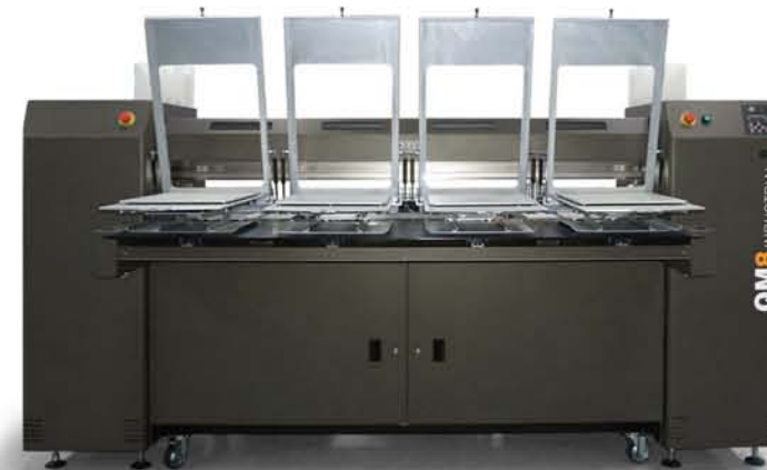
4-6-8 Pallets and large field 650 x 1800mm panel options