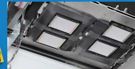
4 head - QM print engine